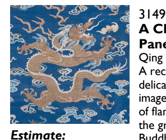
Estimate: $800 / $1,200

Each is in a mirrored image, threaded in a golden yellow on blue silk ground, depicting flower vases and books, framed with a golden mat. {H 32 3/4 x W II 1/4 inches (83.1 x 28.5 cm) with frame}. Condition: Wear to frame.