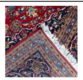
Estimate: $1,500 / $2,500