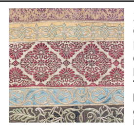
Estimate: $2,000 / $3,000

Comprising hot water kettle with stand, coffee pot, teapot, covered sugar, creamer, wastebowl, and two-handled tray; monograms to all pieces. Tray marked 'GORHAM / D / STÉRLING / 925 1000 / 1822-3 / SPAULDING & CO / 26 IN', other pieces also marked. {Approximate dimensions: Tray 30 3/4 wide x 20 1/4 inches deep, kettle with stand 14 1/2 inches high.} {Approximate weight overall: 10,152 grams.}. Condition: Minor surface wear and tarnish throughout. The tray with scratches. Some staining and splitting to knops. Coffee pot handle is slightly loose.