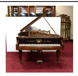
Estimate: $3,000 / $5,000